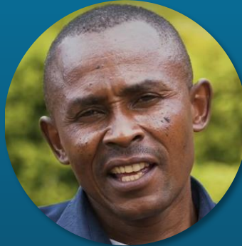
Collina Msongole Malawi